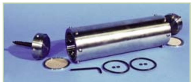
#171-19 Double-End Cell Assembly, 500 mL