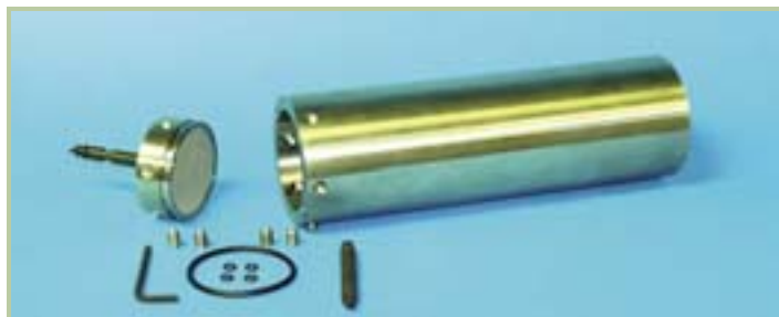
#171-20 Single-End Cell Assembly, 500 mL